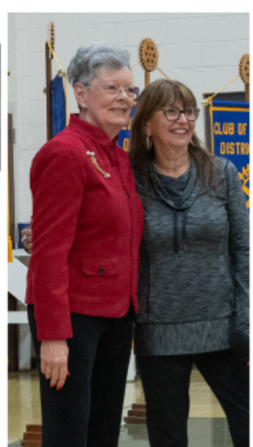
Dancing Macarena & Inspiring the Volunteers & Members