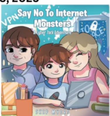
Skip Myers LexisNexis Risk Solutions